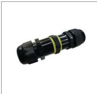
IP 68 2 Way connector for suitable cable diameter ( 6.5mm - 9.5mm )