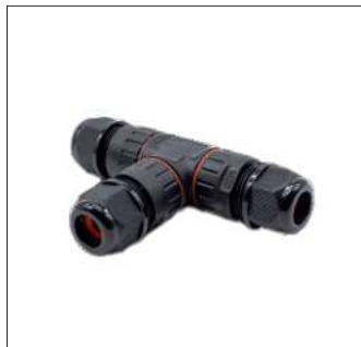
IP 68 3 Way connector for suitable cable diameter ( 6.5mm - 9.5mm )